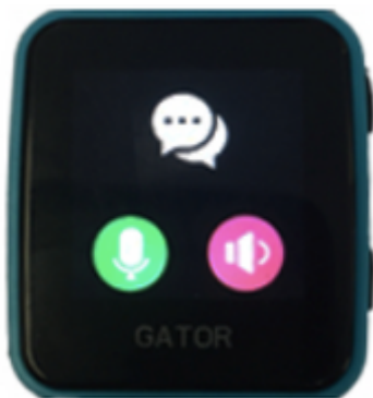
Voice Chat display on watch

TIP: To receive a voice chat the recipient needs to have downloaded the TicTocTrack app onto their smart phone and requires their own unique user login to the app. To add additional users to your account please see the steps below.