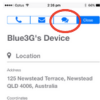
Voice Chat access from app

After tapping on the chat button for your linked contact on your watch, press the green microphone button to record your message. Once finished it will automatically be sent to the linked contact.